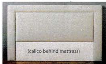
Padded Band (BH2)

15cm wide padded band with 7mm piping inserted below band and 60cm high insert. 5cm seamed walled side. Calico insert sits behind mattress.