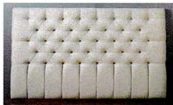
Deep Diamond Button (BH7)

Upholstered with covered deeply inset buttons in a diamond configuration. Fabric must be railroaded. Optional surrounding wings can be added. Base cut-out unavailable.