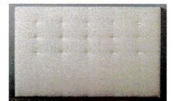
Rectangle Panel (BH8)

Horizontal and vertical seams sewn into fabric to create rectangle panels along with blind button detail. Best for plain fabrics.