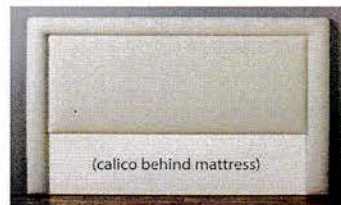
Padded Roll (BH3)

Padded roll with 7mm piping inserted below roll. Roll width is 9cm for single bed, 12.5cm all other sizes. 60cm high main insert sits deeper than surrounding roll. Calico insert sits behind mattress. Does not sit flushed to wall. Skirting board cut-out unavailable.