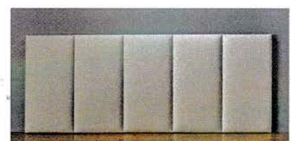
5 Panel (BH15)

Five separate panels with plain fronts and no side seams. If bedhead to sit on floor, panel joining plates and floor support legs available on request and fastened onsite. QS and KS sizes only.