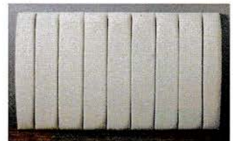
Vertical Panel (BH6)

Shapes available: 1 to 8 and 9 if no piping required.