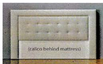
Square Panel Insert (BH13)

15cm wide padded band and square panel sewn insert with blind button detail. Calico insert sits behind mattress. Best for plain fabrics. Single bed size not available.